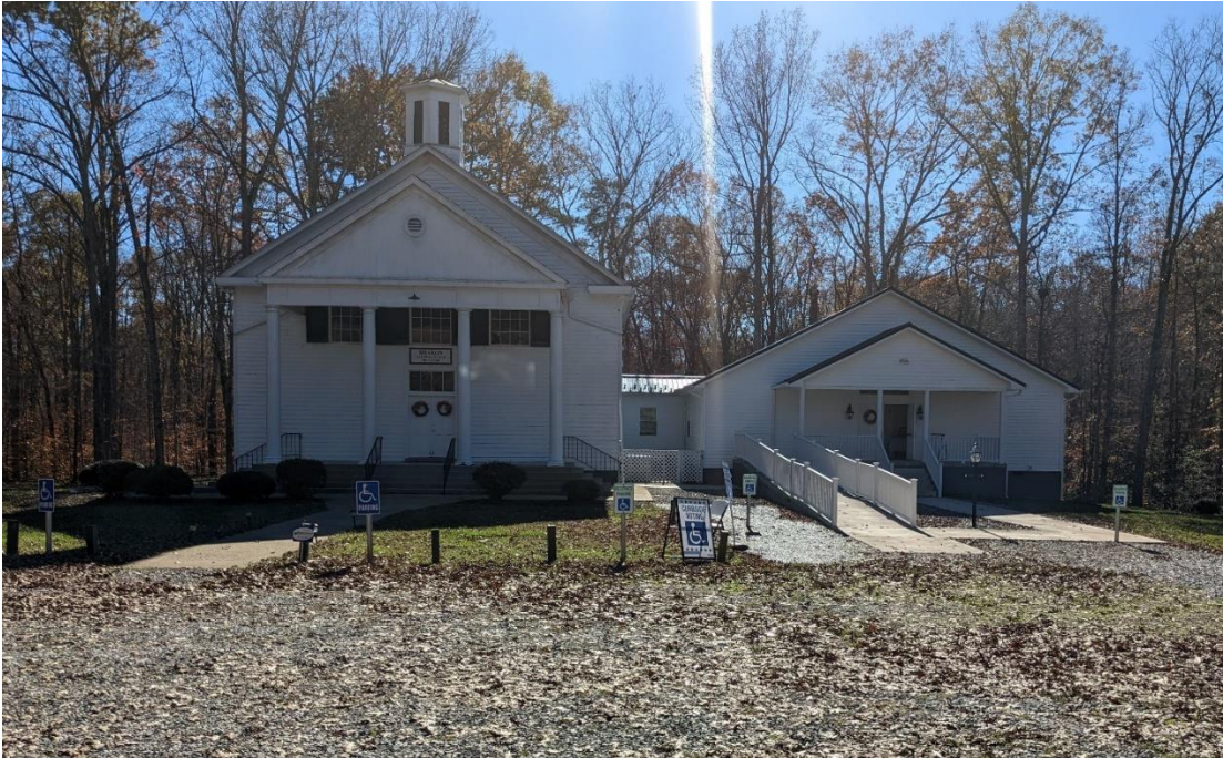
Manassas—had to travel across traffic to get to curb cut